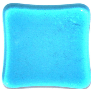
1 layer, total 3 mm The glass was pulled inwards

Like any other liquid, glass has its own surface tension, which for glass is approximately 5 millimetres. This implies that glass, when heated up to 800 °C / 1500 °F will pull or flow to a thickness of approximately 5 millimetres. This is important to keep in mind when making new glass pieces! Most fusing glass is manufactured in a standard thickness of 3 mm. When you want to fully fuse 2 pieces together, it is therefore advisable to stack 2 pieces on top of each other that are exactly the same size. Then you can expect a result of similar size and shape after firing (the edges will be somewhat round and nicely fused to one piece). It also means that with 3 layers of each 3 mm glass (total 9 mm), your glass will flow outwards and flatten to a thickness of maximum 5 mm. The size will increase and the originally sharp edges will become smoothly curved, the shape will have become more round. Fusing a piece of 3 mm to high temperatures will result is a smaller piece, which has changed in shape and grown in thickness. A very small piece can even be fused to a little ball in this way!