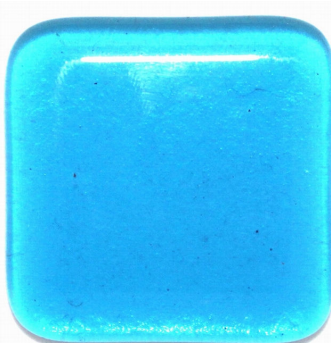
2 layers, total 6 mm No loss of shape, nicely rounded edges