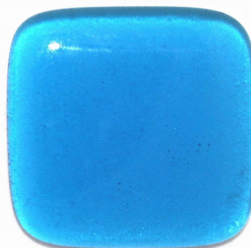
3 layers, total 9 mm Size has grown and shape has "blown up"